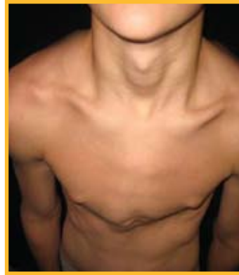
7. Overhead view