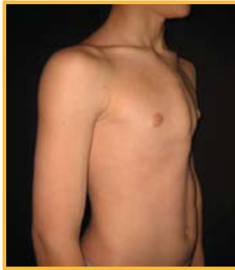
6. Right 45 degree