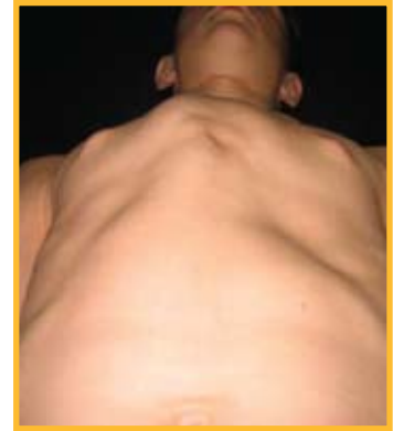
8. Bottom up view