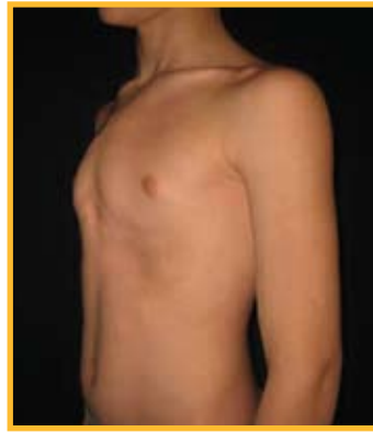
3. Left 45 degree