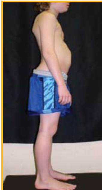
10. Full view right side