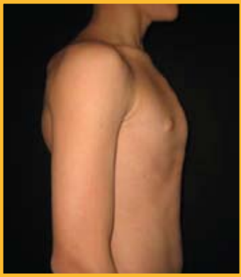
5. Right side view