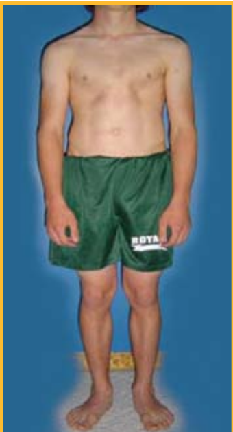
9. Full view front