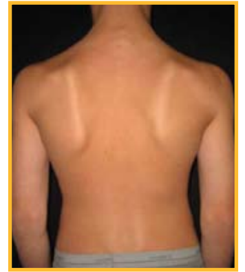
4. Back view