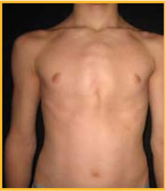
1. Front view